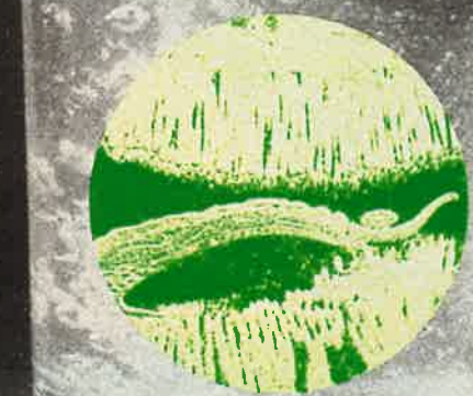
A SINGLE-CELL PARASITE FOUND IN TAP WATER (MAGNIFIED 2,400 TIMES)